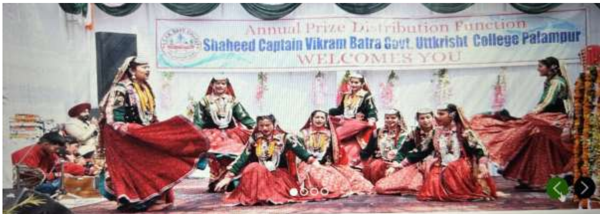
Another highlight of the function— a vibrant cultural spirit with the energetic performance by the Gadiyali Nati team.